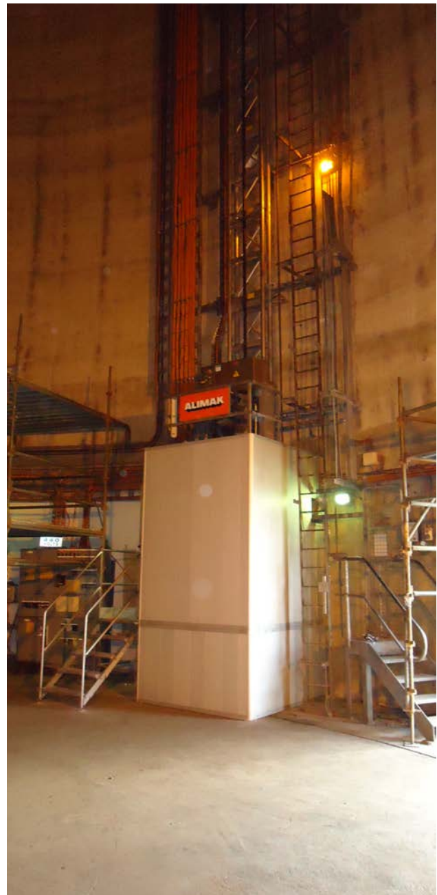
Mt Isa Mines, QLD, Australia