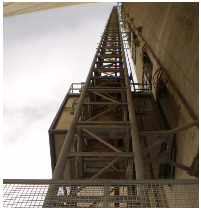
Graincorp Grain Handling Facility, QLD, Australia