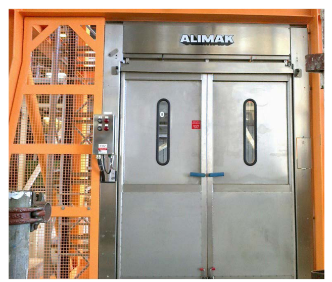
North Rankin A Platform, North West Shelf, Indian Ocean, Australia

The Alimak SE-Ex 1200 elevator has been in operation on the North Rankin A platform since March 2012. Designed for intermittent service, the luggage goods elevator has an expected life of 30 years minimum with regular maintenance.