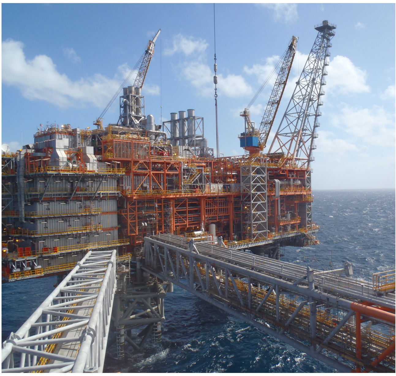
North Rankin A Platform, North West Shelf, Indian Ocean, Australia