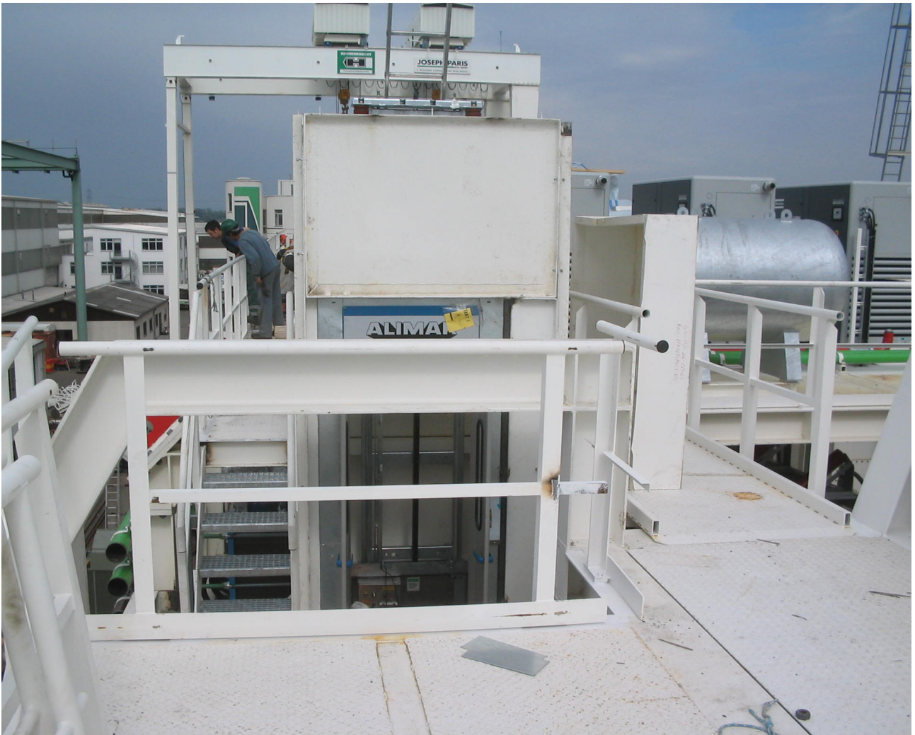
Alimak elevator inside the world's largest tunnel boring machine.