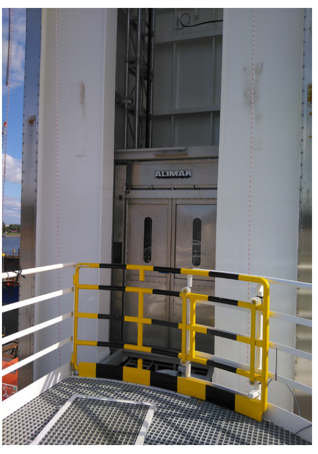
The Alimak elevator on the VOS Start vessel has a variable top landing to provide stepless access during offshore service projects.