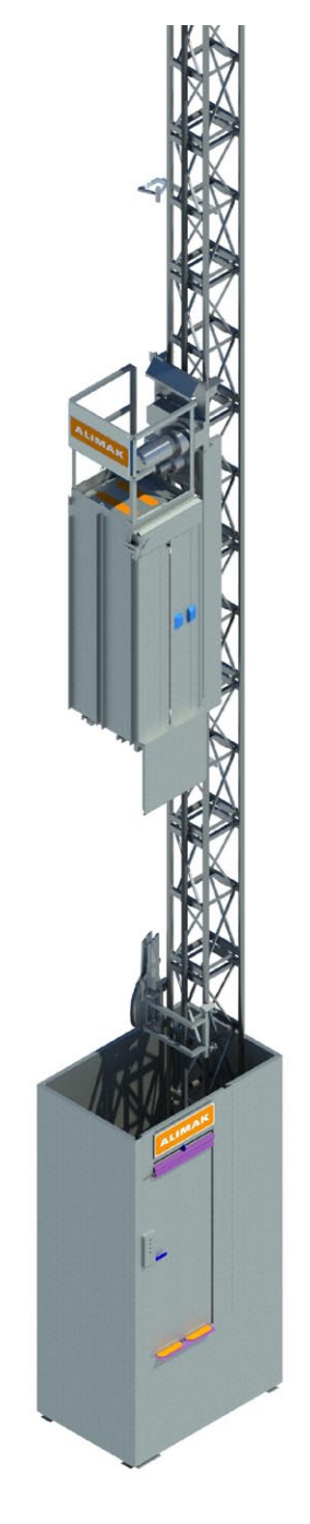
Car door configurations (A, B or C, or A and B)