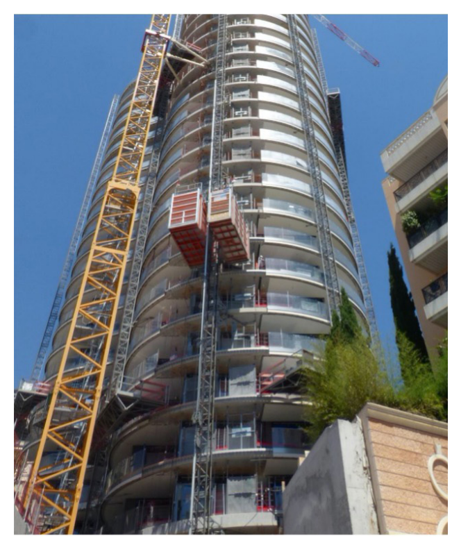
Tour Giroflées, Monaco